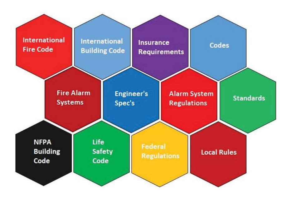
So many fire codes, which ones apply to me?

The Fire Safety Team at EHS works hard to put eyes on all 466 University buildings in an effort to keep our campuses free from fire. With a staff of three full-time employees, and three part-time miscellaneous wage employees, the Fire Protection Team is actively involved with plan reviews and inspections of new construction and renovations; Fire Prevention/Extinguisher Training of Residence Life RA's, Graduate Assistants and undergraduate lab students; and conducting fire drills throughout the year at residence halls, public assembly, and academic buildings. Major events throughout the year including but not limited to, Commencement, concerts at BCC, Coast Day, and football games are reviewed for fire code compliance. All of the functions of our group involve the knowledge and use of applicable fi re codes in the State of Delaware. The recently installed Campus Fire Safety Plan protocol is found <u>here</u> on the EHS Web Page, provides quick and easy access to the typical code applications at UD without the hassle of looking items up at the national, state or city level.